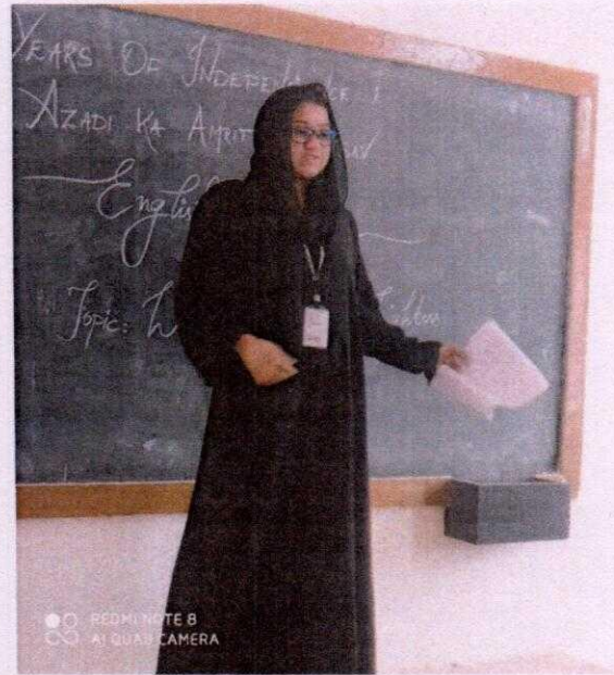
Elocution competition held at Lecture Hall 3